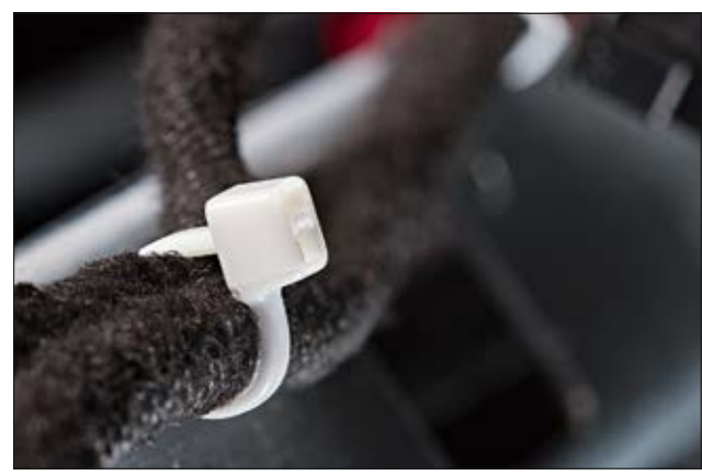
White T-Series cable ties for higher fire protection (PA66V0).