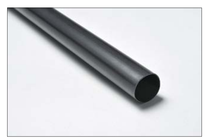
TR27 is ideal for safety sensitive areas.